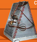
— Uncased Vertical A-Coil CAPVU