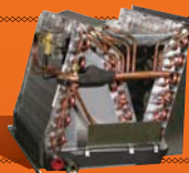
— Uncased Vertical N-Coil CNPVU