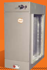
— Cased Slab Coil CSPHP