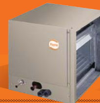
— Cased Horizontal N-Coil CNPHP