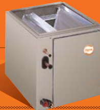
— Cased Vertical N-Coil CNPVP / CNPVT